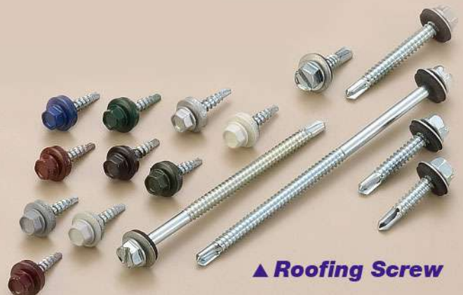
▲ Roofing Screw