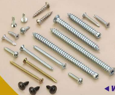
◀ Window Screw