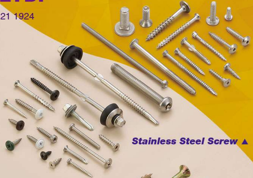
Stainless Steel Screw ▲